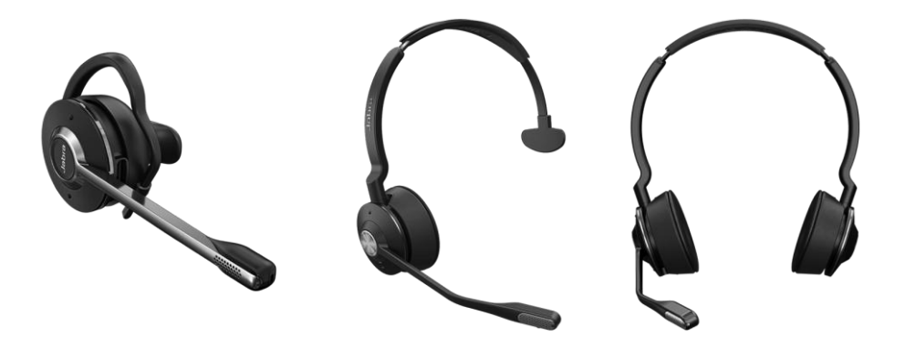
Figure 2 Convertible (left), Mono (middle) and Stereo (right) Headset

The Headset form factors are identical for models compatible with Jabra Engage 65 and Jabra Engage 75 but the software differs to handle the differences in the Base Station interfaces. There are three TOE Headset form factor variants: Convertible, Mono and Stereo. The variants differ in a way they are worn by the user. They are illustrated in Figure 2. Functionally each headset variant is identical and runs identical software. The difference is in form factor only.