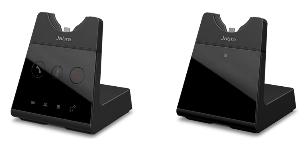
Figure 3 Jabra Engage 65 (left) and Jabra Engage 75 (right) Base Stations

The TOE Base Station may be connected to a Management PC for administration through a USB connection. A properly connected Management PC may be used for administering Base Stations and those Headsets which are physically coupled to a Base Station. The Management PC runs Jabra Direct software for interacting with the TOE. Jabra Direct may run as a stand-alone software or it may be connected to the Jabra Xpress enterprise software for managing a large set of Base Stations and Headsets. Neither the Management PC, Jabra Direct nor Jabra Xpress are part of the TOE.